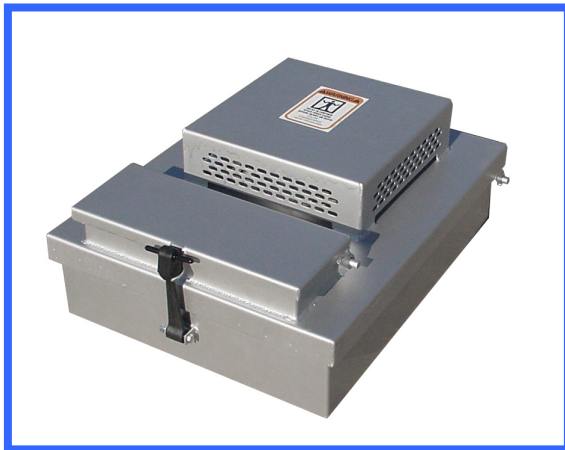
Standard Man way

Roof: Vented Man way 20" X 26" including inspection port 16" x 5" and filter media. Man way filter is constructed of High Loft, Multi-Ply, Non-woven Polyester, UL listed Class II. Allows air to travel through the filter, while restricting dust particles, and escape through the openings while keeping out contaminants and foreign objects. Filter may be removed, cleaned, and reused. The manway allows for fast and convenient bin inspection. Standard Man Ways are painted with a High Quality Enamel.